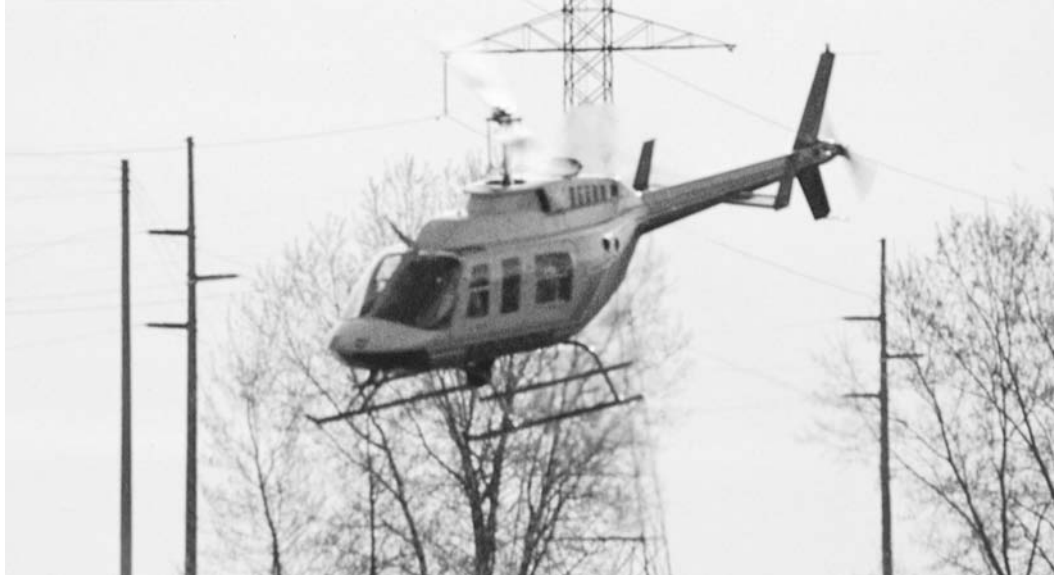
Figure 6. Helicopter surveys can be used to estimate deer abundance in areas with few conifers and four or more inches of snow cover.

To complement population estimates, the physical condition, mortality, and reproductive rates for deer should be monitored regularly to more accurately model deer populations over time. In the absence of population estimates, population indices (e.g., pellet-group counts, numbers of complaints or conflicts, etc.) may suffice as indicators of relative changes in deer abundance.