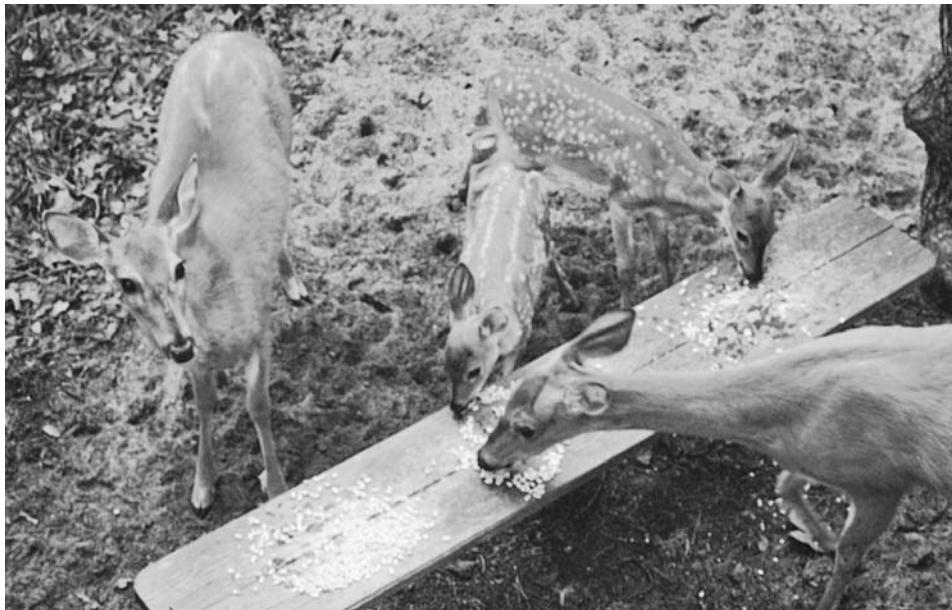
Figure 7. Feeding stations for observing deer may increase fawn production from adult females in good condition.

Repellents have traditionally been classified as odor- or taste-based products. Examples of odor-based repellents include products containing rotten eggs, soap, predator urine, blood meal, and other animal parts. Typically, these repellents are poured onto absorbent cloth or placed in a bag and suspended above the ground at densities of up to 1,150 bags/acre (Conover