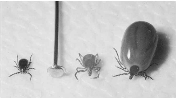
Figure 2. Male, female, and engorged black-legged ticks, with stick pin as reference.

Agricultural producers have indicated that deer cause more damage than other wildlife species (Conover and Decker 1991, Conover 1994, Wywiałowski 1994). Agricultural damage by deer was greatest in the northeastern and northcentral United States, with at least 41 percent of producers reporting damage (Wywiałowski 1994). Conover (1997) conservatively estimated annual deer damage to agriculture at $100 million.