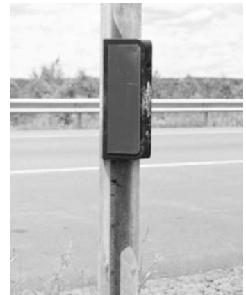
Figure 13. It is not clear that roadside reflectors will consistently reduce deer-vehicle accidents.

Wildlife warning whistles (deer whistles) attached to cars have been used in an attempt to reduce deer-vehicle collisions. These whistles operate at frequencies of 16 to 20 kHz and are intended to warn animals of approaching vehicles. There is no research,