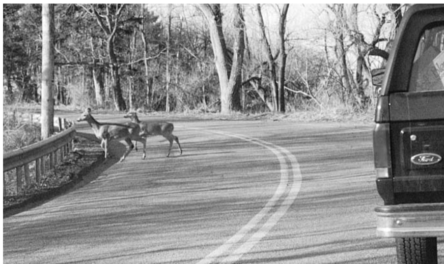
Figure 14. Deer often travel in family groups, so motorists should be cautious if one or more deer are seen on the roadside.

Highway departments install fencing along roadsides for many reasons in addition to preventing deer-vehicle collisions. The effectiveness of fencing for reducing numbers of deer-related accidents is limited unless properly maintained “deer-proof” fences are installed (Falk et al. 1978, Feldhamer et al. 1986). Romin and Bissonette (1996) reported that only ten states used fencing combined with overpasses/underpasses to lower deer-vehicle accidents, but more than 90 percent of state highway departments indicated fencing was effective for preventing animal-vehicle collisions. A 90 percent reduction in deer-vehicle accidents was achieved along a 7.8-mile section of I-70 in Colorado after the construction of an eight-foot-high deer fence (Ward 1982). Accident rates were also reduced in Minnesota (Ludwig and Bremicker 1983) and Pennsylvania (Faulk et al. 1978, Feldhamer et al. 1986) by constructing “deer-proof” fences. It appears that deer rarely jump nine-foot fencing (Feldhamer et al. 1986). Fencing must be frequently inspected with breaks or erosion gullies quickly repaired, because deer will find gaps or weak points where they can cross (Foster and Humhrey 1995, Ward 1982). Bashore et al. (1985) concluded that fencing was the cheapest and most effective method for reducing deer-vehicle collisions along short stretches of highway.