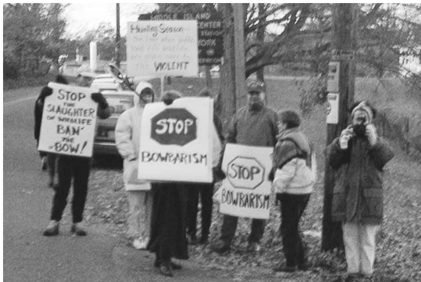
Figure 5. Animal activist groups may oppose controlled hunts, sharp-shooting programs, and other lethal forms of deer removal.

forces and similar transactional approaches (Chase et al. 2000, Curtis et al. 2000a). Communities are now sharing not only the decision-making authority, but also the cost and responsibility for deer management with state and local government agencies under a variety of co-management scenarios. The community scale is appropriate as deer impacts are often recognized by neighborhood groups, and the need for management becomes a local issue. In addition, the success or failure of management actions can be perceived most readily by stakeholders at the community level. Outcomes of co-management are usually perceived as more appropriate, efficient, and equitable than more authoritative wildlife management approaches. Although co-management requires substantial time and effort, this strategy may result in greater stakeholder investment in and satisfaction with deer management.