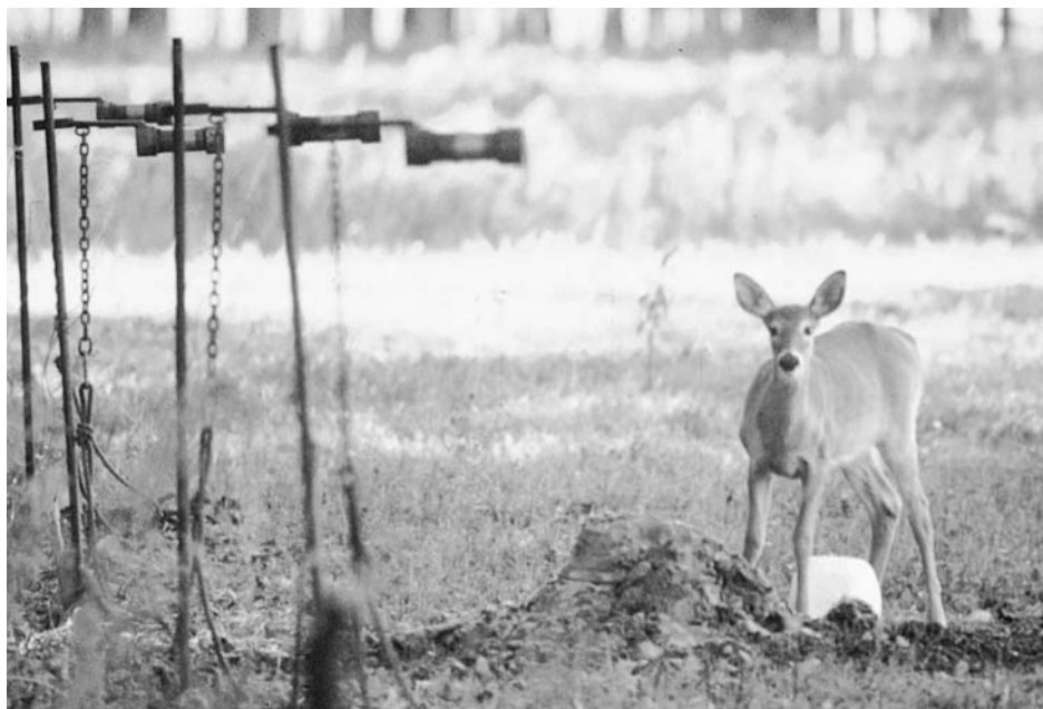
Figure 16. Rocket net positioned and ready for deer capture at a bait station

If capture and translocation is selected as the most appropriate management option, the following recommendations will minimize stress and subsequent capture myopathy during handling procedures. Only experienced personnel should be involved in deer handling or in the immediate area of the capture site. When physically restraining deer (i.e., net guns, drop nets, rocket nets, Clover traps) it may be advantageous to sedate each animal while extracting them