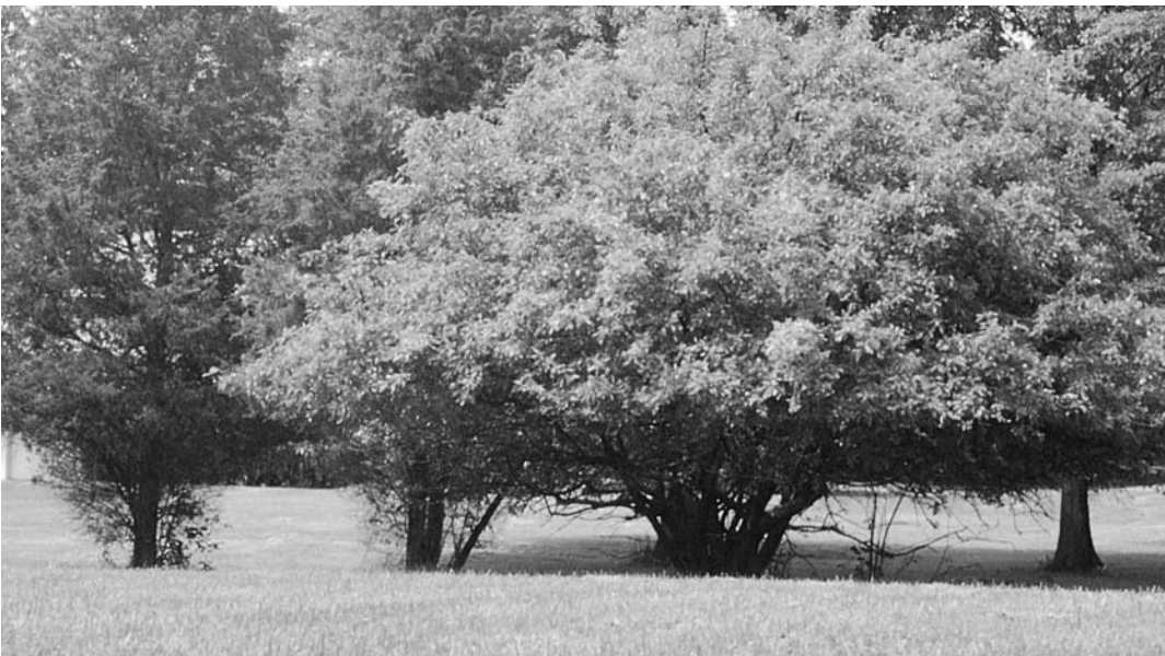
Figure 3. Overabundant deer remove vegetation to a height of approximately six feet, creating a browseline.