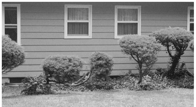
Figure 1. Browsing damage caused by repeated deer feeding on ornamental shrubs.

tors. Homeowners may consider it a nuisance when deer consume garden and landscape plantings (Figure 1). More importantly, an overabundance of deer may cause significant economic losses associated with decreased crops, vehicle collisions, or Lyme disease. Deer also affect forest ecology by feeding on preferred plants and altering the biodiversity in parks and natural woodlands. Human safety can be compromised because increases in deer-vehicle collisions are positively correlated with greater deer abundance (Blouch 1984, Etter et al. In press). For example from 1984 to 1994, as the deer population climbed in the community of Bellvue in Sarpy County, Nebraska, the number of deer-vehicle collisions in that county increased 325 percent (Hygnstrom and VerCauteren 1999). Conover et al. (1995) estimated that more than 1 million deer-vehicle collisions occur annually in the United States, and that annual vehicle repair costs from those accidents exceeded $1.1 billion. They further estimated that each year 29,000 human injuries and 211 human deaths occur as a result of deer-vehicle collisions. Although these numbers are low compared with other sources of human fatalities, they are of concern.