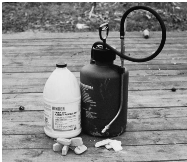
Figure 8. Several commercial repellents may reduce feeding damage for five or more weeks depending on deer foraging pressure and density.

Putrescent whole egg solids are the active ingredient in several odor-based, fear-inducing repellents (e.g., Deer-Away, Deer-Off, Deer Stopper, Big Game Repellent) that have been shown to be effective in