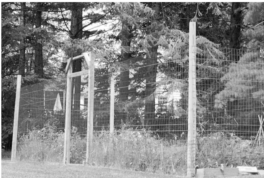
Figure 9. High-tensile barrier fence for protecting a home garden from deer damage

A wide variety of fencing systems, including baited single wires (Porter 1983, Hygnstrom and Craven 1988), three-dimensional outriggers (Tierson 1969), and slanted and vertical fences up to eleven feet in height (Longhurst et al. 1962, Halls et al. 1965, Palmer et al. 1985), have successfully excluded deer under some conditions. Often simple designs are effective only under light deer pressure (Brenneman 1983, McAninch et al. 1983) or for relatively small areas. Low-cost, easily constructed fences may perform quite well for small areas (less than ten acres) during the growing season when alternative foods are available to deer. Low-profile fences, however, are seldom satisfactory for protecting commercial orchards or ornamental plantings in winter, especially if snow restricts deer from using alternative food sources. Landowners must also check local ordinances and covenants to determine if electric fences can be used, or if fences of any kind can be constructed on their property.