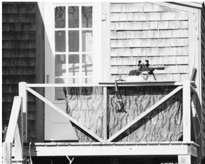
Figure 17. Blind and rifle on a raised deck used as a sharp-shooting station

Several communities have employed trained, experienced personnel to lethally remove deer through sharpshooting (Figure 17) with considerable success (Deblinger et al. 1995, Drummond 1995, Jones and Witham 1995, Stradtman et al. 1995, Ver Steeg et al. 1995, Butfiloski et al. 1997, DeNicola et al. 1997c). A variety of techniques can be used in sharp-