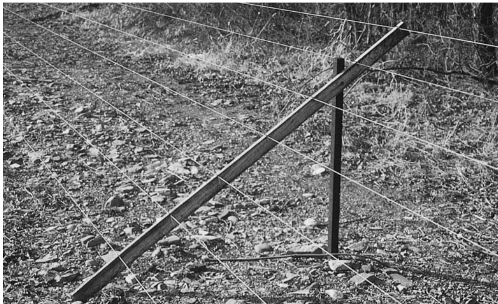
Figure 11. Deer have poor depth perception and will avoid areas protected by electrified, slanted-wire fences.

Multistrand, electrified, high-tensile, smooth-wire fences consist of several individual wires fastened to braced wooden assemblies, with wires tightened to 150 to 250 pounds of tension (McAninch et al. 1983, Palmer et al. 1985). Sturdy, well-braced corner and