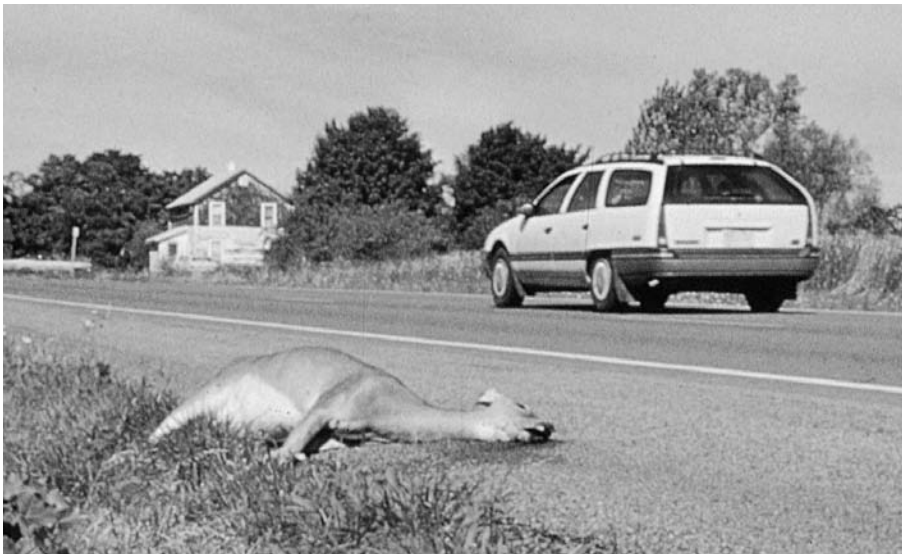
Figure 12. As deer densities increase in suburban areas, deer-vehicle collisions are occurring more frequently.

Deer-related vehicle accidents (Figure 12) are a major concern in some communities, and collision rates are apparently correlated with deer abundance. Several techniques have been used to reduce deer-car collisions, however few have been documented to be consistently effective, and some have no measurable effect on deer behavior.