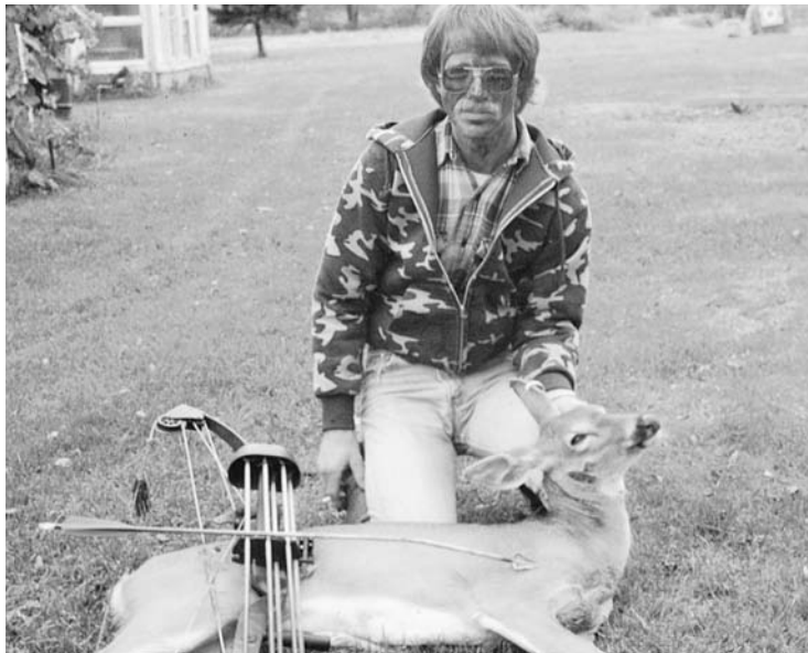
Figure 18. Bowhunters can remove deer from suburban locations where firearm hunts are impractical.

The potential for intervention and/or interference by activist groups is often high when using hunters to manage locally overabundant deer populations. Thus,