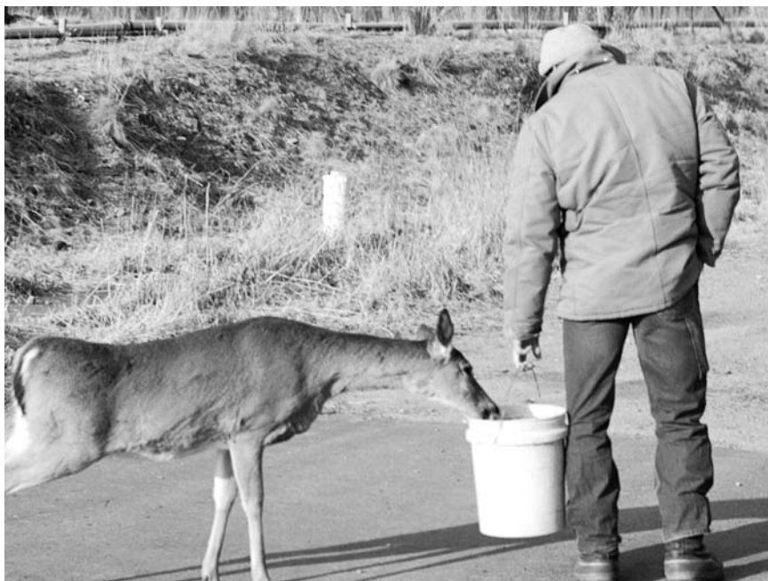
Figure 4. Feeding deer increases the potential for conflicts by making deer less wary of people.

White-tailed deer are extremely adaptable, both in habitat and diet selection. Deer are an edge species, faring well in transitional areas between forests, agriculture, grasslands, and even suburban landscapes. Forests, thickets, and grasslands provide deer with protective cover and natural foods, and agricultural fields can contribute abundant, high-quality forage. The diets of white-tailed deer often depend on the