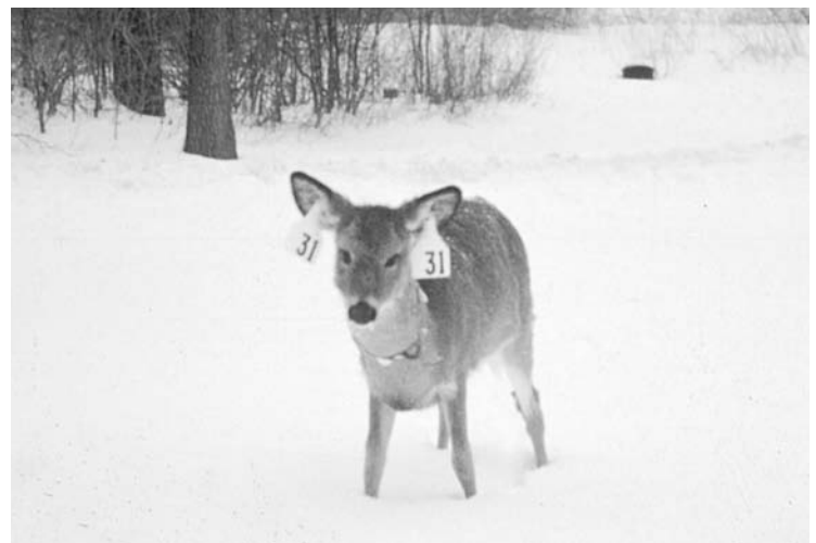
Figure 19. Cattle ear tags and radio collars are used to individually mark deer that are included in a research project.

The FDA has concerns about the safety of consuming deer treated with experimental drugs and currently requires that all treated, free-ranging deer be marked with warning tags (Figure 19) that stipulate consumption restrictions. It is not clear if or when FDA restrictions on consumption of deer meat treated with experimental drugs will be modified. In addition, fertility control agents are usually delivered to deer using either dart rifles or biobullets. Restrictions on firearms discharge in suburban areas often limits practical delivery of drugs to free-ranging deer. Consequently, there are many aspects of the regulatory and commercialization process and delivery systems that still need to be developed before contraceptive vaccines can be a viable management alternative for communities with overabundant deer herds.