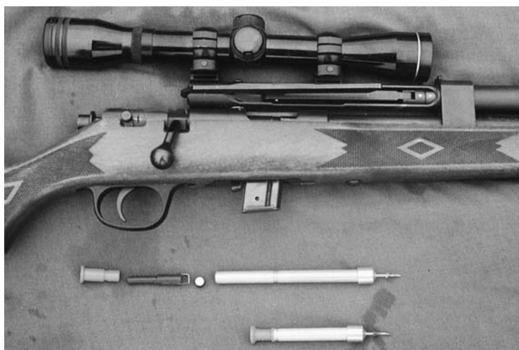
Figure 20. Dart rifle used for delivery of antifertility agents, vaccines, and immobilizing drugs