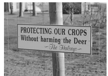
Figure 10. Woven-wire fences are the most effective way to protect large areas (>50 acres) of high value crops.